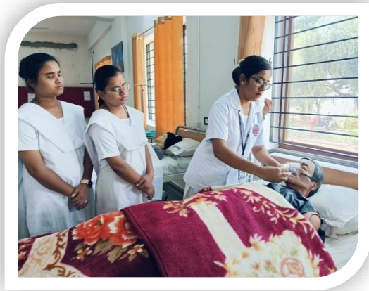
NURSING FOUNDATION LAB