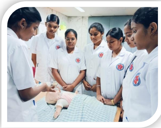
CHILD HEALTH NURSING LAB