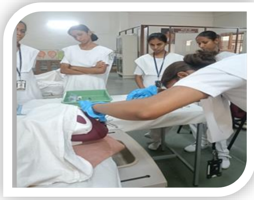
MIDWIFERY AND OBSTERTICS NURSING LAB