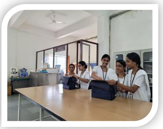
COMMUNITY HEALTH NURSING LAB