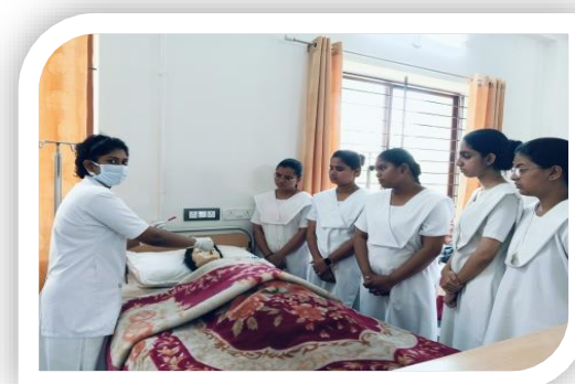
ADULT HEALTH NURSING LAB